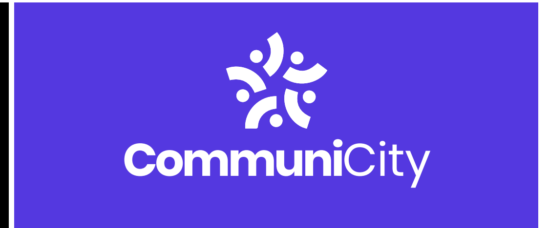
White version with purple background